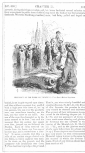
REPRODUCTION OF THE SCENE IN WHICH THE HEROINE DIES