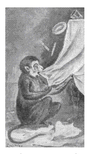
Tricky Upset Everything

How many escapes the monkey had before the runaway slave presented it to the missionary—from whom I first heard of it—no one knows. It certainly had not much hair on when it arrived, and there was an ominous scar on its head, and its ears were not wholly symmetrical. But the children were vastly delighted with it, and after much kind treatment the creature was restored to rude health, and, I must confess, to quite too rude spirits. The children wanted him baptized by the time-honoured title of 'Jacko'; but by a series of exploits in which the monkey distinguished himself at the expense of every member of the household in turn, it became evident that only one name would fit a quadruped of his peculiar disposition; and that was 'Tricky.' Tricky, therefore, he was called, and as Tricky he lived and—did not die.