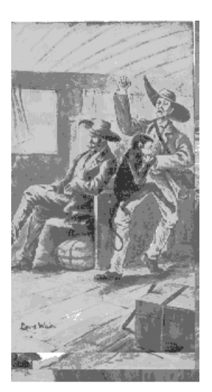
Buried His Teeth in the Conductor's Wrist