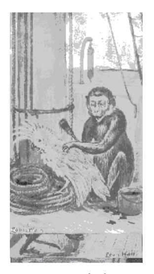
He Began with the Parrot

About the end of that period there came a crisis. The ship was nearing port, and a heavy cleaning was in progress. Among other things the ship's boats had to be painted. In an evil hour one of the men went below to dinner, and left his paint-pot standing on the deck. If Tricky had lost a chance he would not have been a monkey at all. Needless to say, he rose to the occasion. That his supreme hour was come was quite evident from the way he set to work at once. He began with the parrot, which he painted vermillion; then he passed the brush gaily along the newly varnished woodwork—daubed the masts and shrouds all over, obliterated the name on the life-buoys, and wound up a somewhat successful performance by emptying the pot over the Captain's best coat, which was laid in the sun to get the creases out.