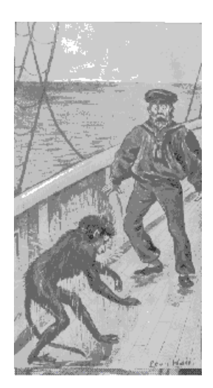
It Was Only Tricky Shaking the Salt-Water Off

The executioners were rather ashamed of themselves when they saw how matters stood; but instead of softening them, this dangling mockery of a dead monkey still further roused their wrath, and the boatswain was told off to end the drama by tossing Tricky into the sea. The boatswain was up the shrouds in a moment, and loosening the rope with one hand, and catching the monkey by the tail with the other, he swung poor Tricky a good yard over the ship's side into the Atlantic.