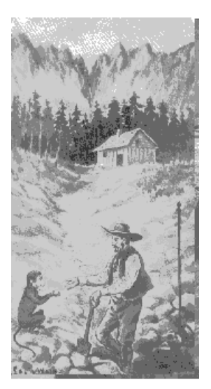
The Nugget of Gold