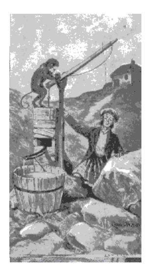
All Was Ready

gathered all his strength, and with a tremendous sweep of his arms sent Tricky flying into space. Of course you know what happened. The rope—it was quite rotten—broke, and Tricky landed on his four paws, and stood grinning at his executioner as if he would like it all over again.