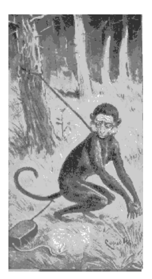
The Can of Gunpowder Tied to His Tail