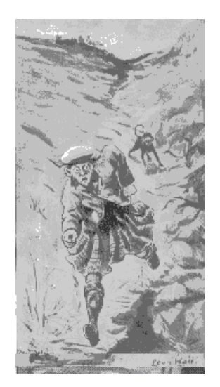
The Shpeherd Bolted Like Wildfire

THE island on which the Captain of the Vulcan exiled Tricky was marked on the chart 'uninhabited.' But the chart was wrong. Ten years before, a shepherd had come there, and now lived with his wife and family near the top of the great sea-cliff. You may judge of the sensation when a real live monkey appeared in the early morning in this remote and lonely spot. The shepherd was watching his sheep when the apparition rose, as it were, from the ground. He had never seen a monkey before, any more than the sheep; and sheep and shepherd bolted like wildfire. Tricky, of course, followed the biped, for he had always been accustomed to human society; and as the shepherd fled towards the hut, he saw the monkey close at his heels. So he made a rush at the open door, and pulled it after him with a bang which almost brought down the house.