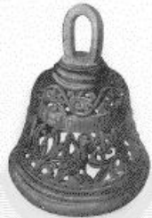
Byzantine Brass-Bell of Bronze in the Collection of the Mus. of Berlin

The great development in the use of bells may be identified with the eighth century. It was then, seemingly, that they began to be regarded as an essential part of the equipment of every church, and also that the practice of blessing them by a special form of consecration became generally prevalent. If we interpreted literally a well-known passage in Bede ( Hist. Eccl. , IV, xxi), we should have to believe that already in the year 680, the bell ( campana ) that was rung at Whitby at the passing away of St. Hilda was heard at Hackness thirteen miles off. But the whole setting of the story implies that Bede regarded the occurrence as miraculous and that the distance might as well as have been thirty miles as thirteen. On the other hand, it is clear that in the eighth century church towers began to be built for the express purpose of hanging